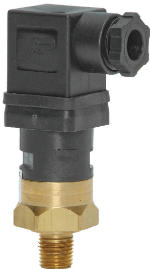
Model Shown: PDA414-2

Pressure/Vacuum switches can provide an electrical signal to warn or prevent over- or under-pressurization which can be harmful to a machine or process. The pressure is adjustable. Switches are sealed, vibration resistant, and built to provide reliable protection. They can be either direct or remotely mounted. Switches are available in three basic configurations: